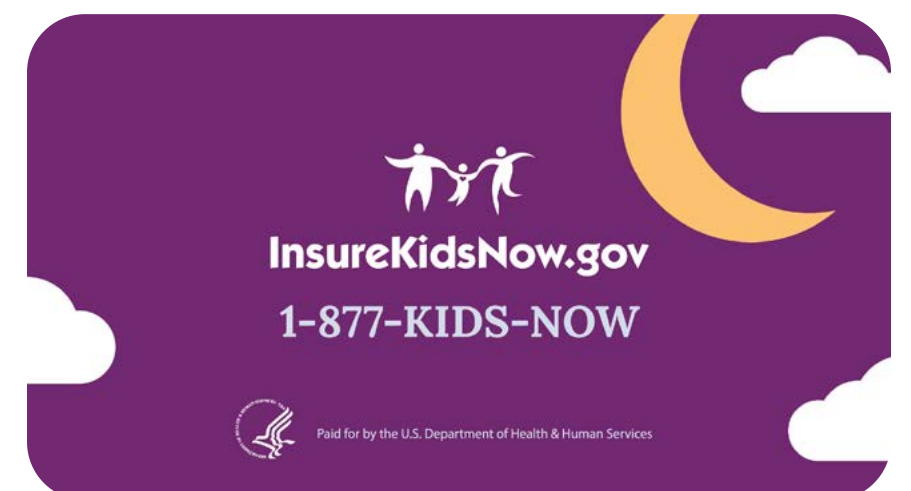
SUPER: InsureKidsNow.gov 1-877-KIDS-NOW Paid for by the U.S. Department of Health & Human Services VO: Visit InsureKidsNow.gov or call 1-877-KIDS-NOW. Paid for by the U.S. Department of Health & Human Services.