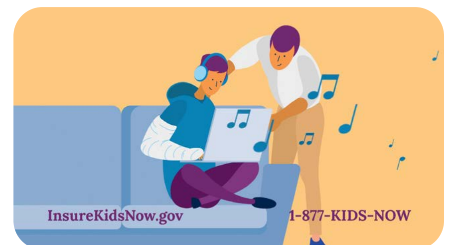
SUPER: InsureKidsNow.gov 1-877-KIDS-NOW Cut to the same teenage boy, now in a cast, seated on the couch, and sharing music with his father. VO: You may now be eligible for Medicaid too,...