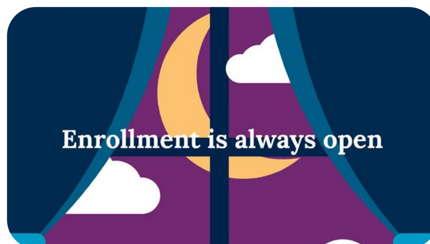
SUPER: Enrollment is always open. The camera pushes through the window, to the night sky. VO: Enrollment is always open.