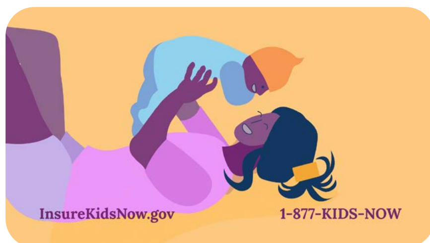
SUPER: InsureKidsNow.gov 1-877-KIDS-NOW A mother plays with her baby. VO: As parents, we get peace of mind...