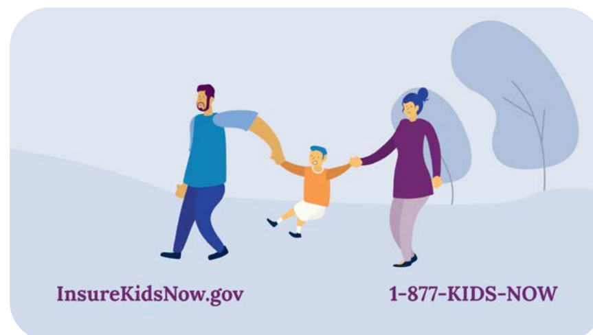
SUPER: InsureKidsNow.gov 1-877-KIDS-NOW Open on a family, mimicking the form of the InsureKidsNow.gov logo, walking outdoors. VO: Medicaid and CHIP offer free or low-cost health coverage for kids and teens.