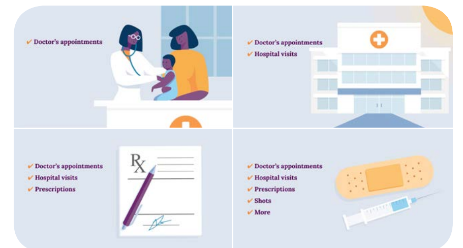
SUPER: (builds) Doctor's appointments, Hospital visits, Prescriptions, Shots, More We quickly transition through scenes illustrating the talking points. VO: These programs cover doctor's appointments, hospital visits, prescriptions, shots, and more.