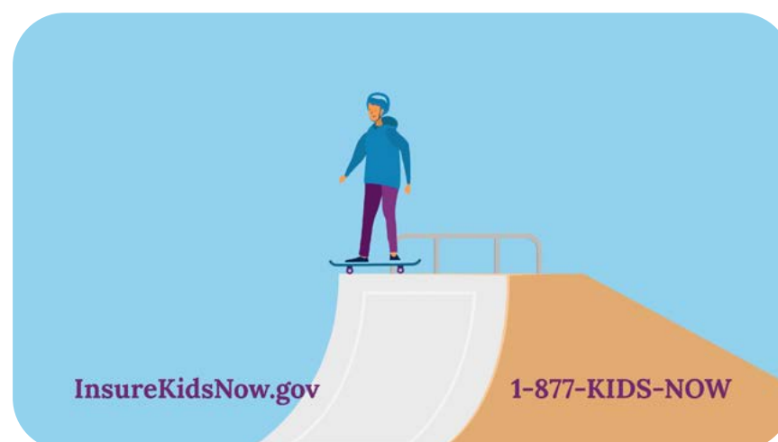
SUPER: InsureKidsNow.gov 1-877-KIDS-NOW Cut to a teenage boy who skateboards down a ramp and crashes. VO: ...knowing that our children are covered if they are sick or get injured.