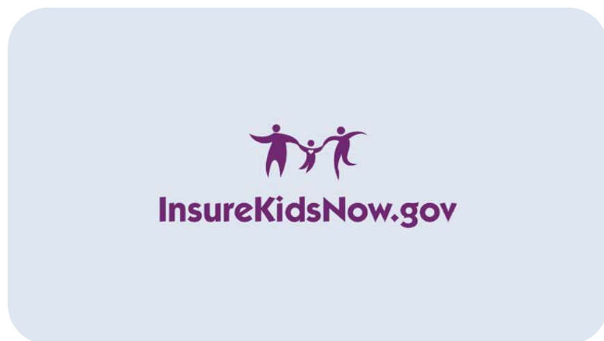
SUPER: InsureKidsNow.gov. Open on the InsureKidsNow.gov logo.