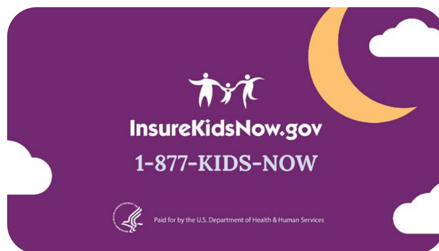
SUPER: InsureKidsNow.gov 1-877-KIDS-NOW Paid for by the U.S. Department of Health & Human Services VO: Learn more at InsureKidsNow.gov. Paid for by the U.S. Department of Health & Human Services.