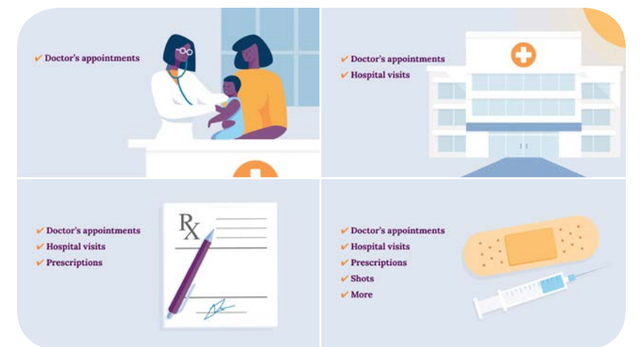
SUPER: (builds) Doctor's appointments, Hospital visits, Prescriptions, Shots, More We quickly transition through scenes illustrating the talking points. VO: Get peace of mind knowing that doctor's appointments, hospital visits, prescriptions, shots, and more are covered.