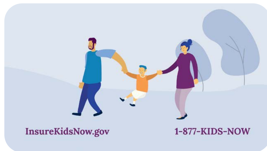
SUPER: InsureKidsNow.gov 1-877-KIDS-NOW Open on a family, mimicking the form of the InsureKidsNow.gov logo, walking outdoors. VO: Medicaid and CHIP offer free or low-cost health coverage for kids and teens.