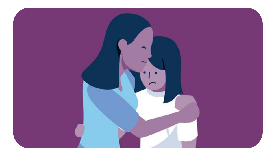
Open on a mother comforting her upset child.

VO: Your child's mental health is important.