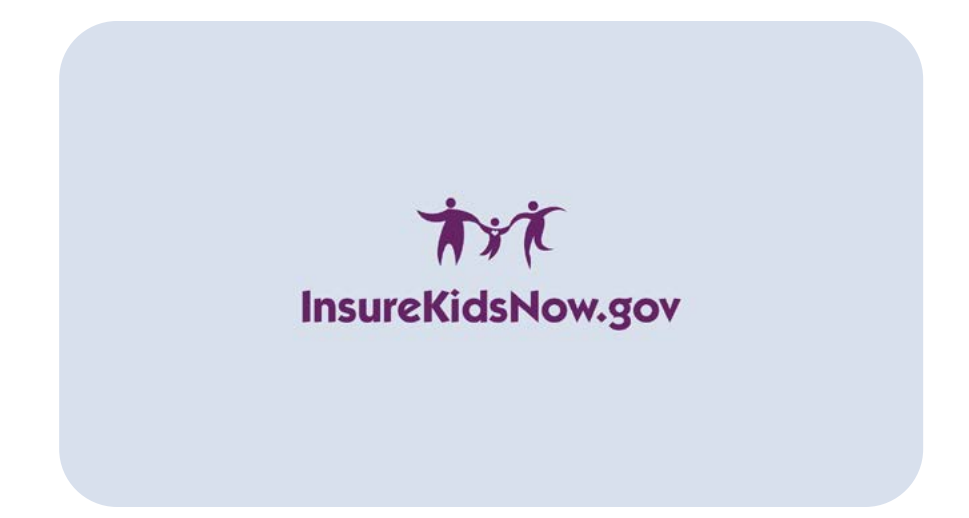
SUPER: InsureKidsNow.gov. Open on the InsureKidsNow.gov logo.